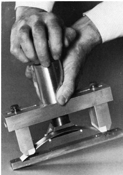
FIG. 2 Stressing Jig and Two-Point Loaded Specimen with Holder (approximately ¼ actual size)

6.3 Deflection Gauges —Deflection of specimens is determined by separate gages or by gages incorporated in a loading apparatus as shown in Fig. 3. In designing a deflection gage to suit individual circumstances care must be taken to reference the deflection to the proper support distance as defined in 10.2 – 10.5.